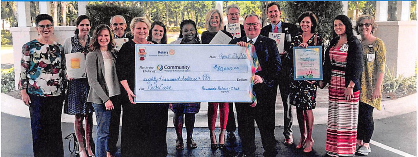
Riverside Rotary Club presented a check for $80,000 from the 2018 Riverside Craft Beer Festival to PedsCare Staff.